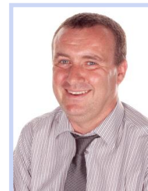
Lee Davis Youth Development Office, Sixth Form